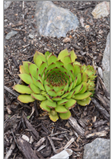
Sunset Hens And Chicks