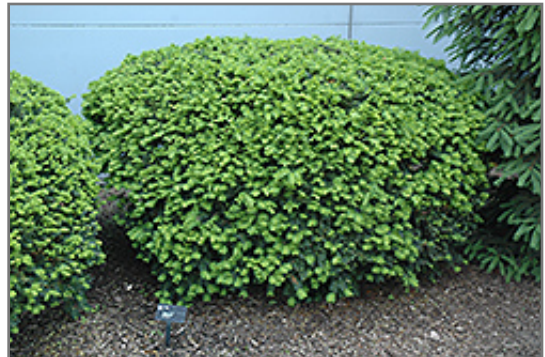
Densiformis Yew