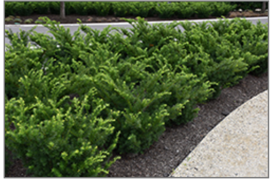
Densiformis Yew