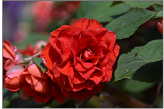
Glimmer Bright Red Double Impatiens flowers