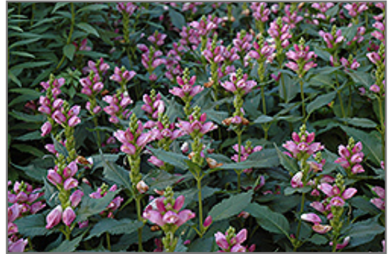
Pink Turtlehead flowers

Pink Turtlehead is recommended for the following landscape applications;