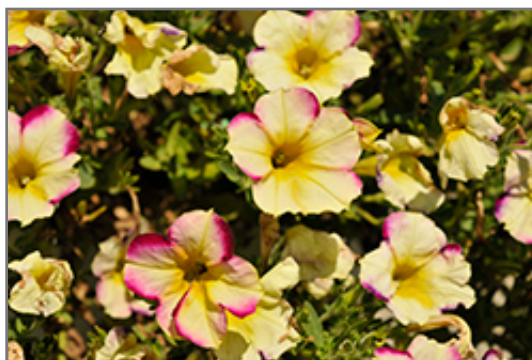
Headliner Banana Cherry Petunia flowers