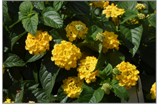
Lucky Yellow Lantana flowers