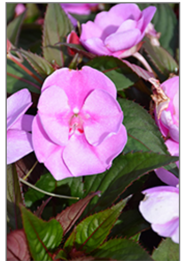
SunPatiens Vigorous Lavender Splash New Guinea Impatiens flowers