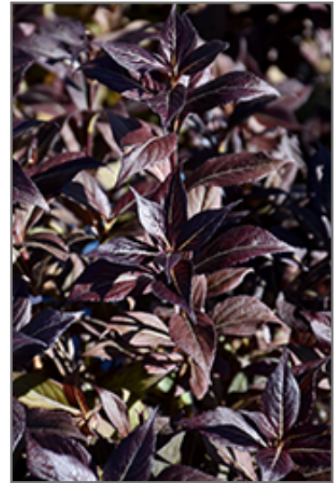
Date Night Stunner Weigela foliage