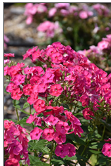
Ka-Pow Pink Garden Phlox flowers

Ka-Pow Pink Garden Phlox is recommended for the following landscape applications;