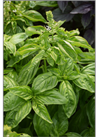
Genovese Basil foliage

Genovese Basil will grow to be about 20 inches tall at maturity, with a spread of 14 inches. When grown in masses or used as a bedding plant, individual plants should be spaced approximately 12 inches apart. This fast-growing annual will normally live for one full growing season, needing replacement the following year.