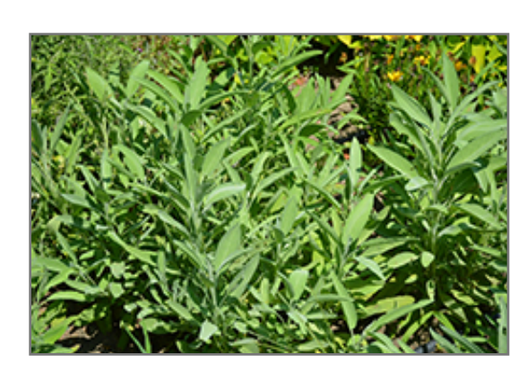
Common Sage

This is an herbaceous perennial herb with an upright spreading habit of growth. Its medium texture blends into the garden, but can always be balanced by a couple of finer or coarser plants for an effective composition. This is a relatively low maintenance plant, and can be pruned at anytime. It is a good choice for attracting bees, butterflies and hummingbirds to your yard, but is not particularly attractive to deer who tend to leave it alone in favor of tastier treats. It has no significant negative characteristics.