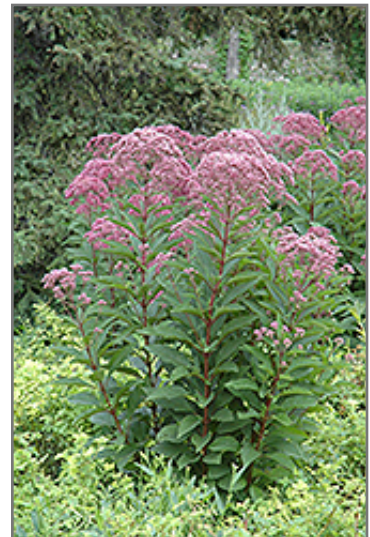
Joe Pye Weed in bloom