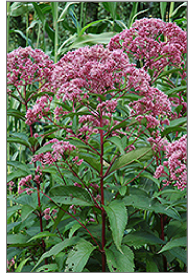
Joe Pye Weed flowers

Joe Pye Weed is recommended for the following landscape applications;