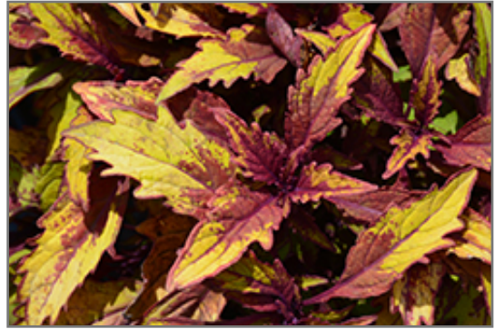
FlameThrower Spiced Curry Coleus foliage

FlameThrower Spiced Curry Coleus is recommended for the following landscape applications;