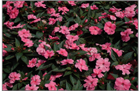
SunPatiens Compact Pink New Guinea Impatiens flowers

SunPatiens Compact Pink New Guinea Impatiens is recommended for the following landscape applications;