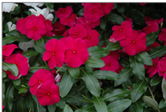
Valiant Burgundy Vinca flowers

This plant will require occasional maintenance and upkeep, and should not require much pruning, except when necessary, such as to remove dieback. It is a good choice for attracting butterflies to your yard, but is not particularly attractive to deer who tend to leave it alone in favor of tastier treats. It has no significant negative characteristics.