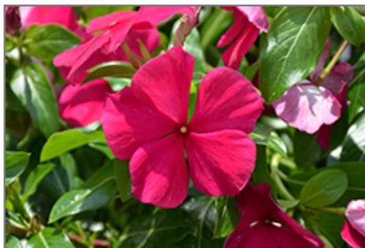
Valiant Burgundy Vinca flowers

Valiant Burgundy Vinca will grow to be about 12 inches tall at maturity, with a spread of 18 inches. Its foliage tends to remain dense right to the ground, not requiring facer plants in front. Although it's not a true annual, this fast-growing plant can be expected to behave as an annual in our climate if left outdoors over the winter, usually needing replacement the following year. As such, gardeners should take into consideration that it will perform differently than it would in its native habitat.