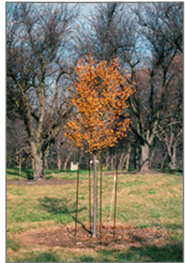
Lancelot Flowering Crab fruit