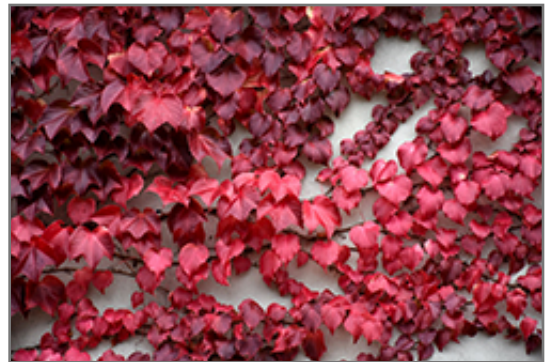
Veitch Boston Ivy in fall