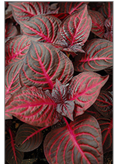
Blazin' Rose Blood Leaf foliage