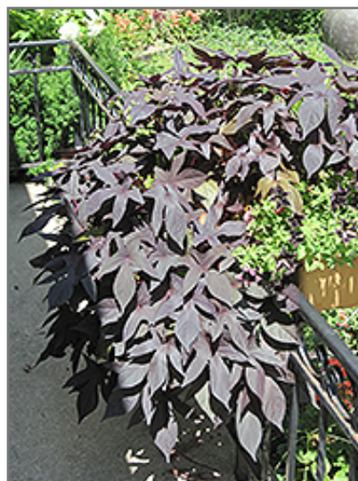
Proven Accents Blackie Sweet Potato Vine