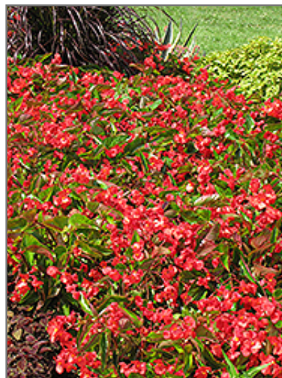
Dragon Wing Red Begonia in bloom