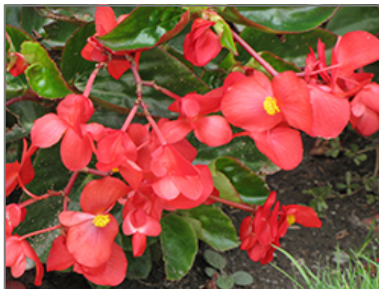
Dragon Wing Red Begonia flowers

Dragon Wing Red Begonia is an herbaceous annual with a trailing habit of growth, eventually spilling over the edges of hanging baskets and containers. Its medium texture blends into the garden, but can always be balanced by a couple of finer or coarser plants for an effective composition.