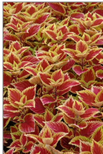
Trusty Rusty Coleus foliage