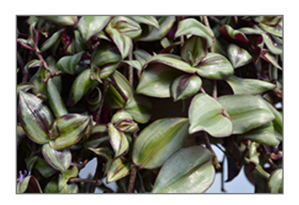
Wandering Jew foliage