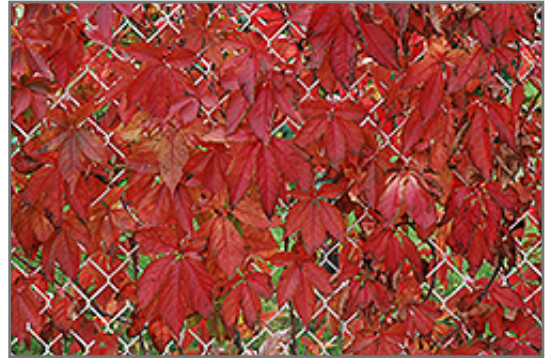
Englemann Ivy in fall

Englemann Ivy will grow to be about 40 feet tall at maturity, with a spread of 24 inches. As a climbing vine, it tends to be leggy near the base and should be underplanted with low-growing facer plants. It should be planted near a fence, trellis or other landscape structure where it can be trained to grow upwards on it, or allowed to trail off a retaining wall or slope. It grows at a fast rate, and under ideal conditions can be expected to live for approximately 20 years.