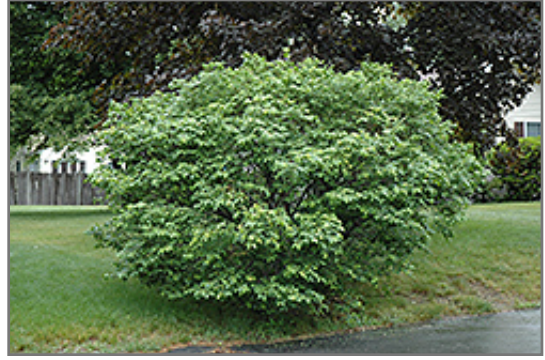
Compact Winged Burning Bush

Compact Winged Burning Bush will grow to be about 7 feet tall at maturity, with a spread of 7 feet. It tends to fill out right to the ground and therefore doesn't necessarily require facer plants in front, and is suitable for planting under power lines. It grows at a slow rate, and under ideal conditions can be expected to live for 50 years or more.