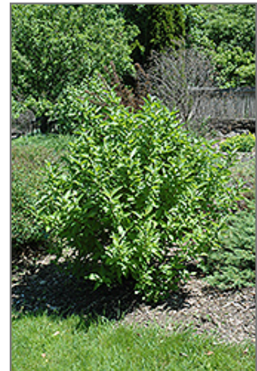
Arctic Fire Red Twig Dogwood