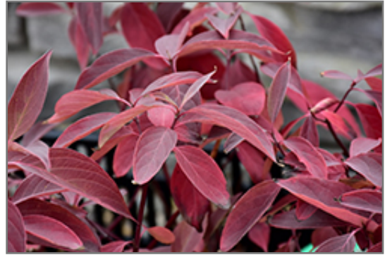
Arctic Fire Red Twig Dogwood in fall

This shrub does best in full sun to partial shade. It is an amazingly adaptable plant, tolerating both dry conditions and even some standing water. It is not particular as to soil type or pH. It is highly tolerant of urban pollution and will even thrive in inner city environments. This is a selection of a native North American species.