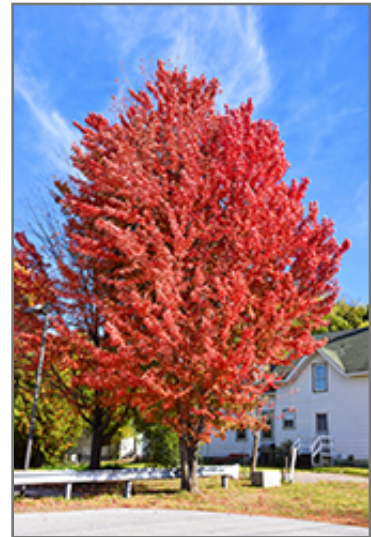
Celebration Maple in fall