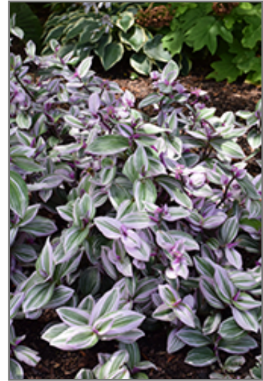
Nanouk Tradescantia

Nanouk Tradescantia is recommended for the following landscape applications;