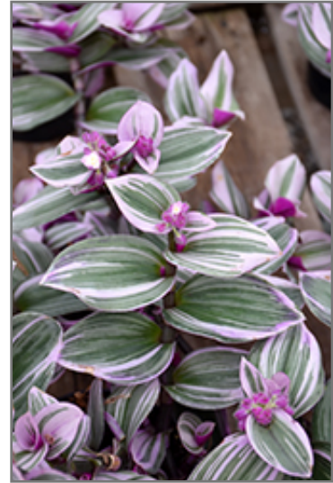
Nanouk Tradescantia foliage

Nanouk Tradescantia will grow to be about 14 inches tall at maturity, with a spread of 14 inches. When grown in masses or used as a bedding plant, individual plants should be spaced approximately 10 inches apart. Its foliage tends to remain dense right to the ground, not requiring facer plants in front. Although it's not a true annual, this fast-growing plant can be expected to behave as an annual in our climate if left outdoors over the winter, usually needing replacement the following year. As such, gardeners should take into consideration that it will perform differently than it would in its native habitat. As this plant tends to go dormant in summer, it is best interplanted with late-season bloomers to hide the dying foliage.