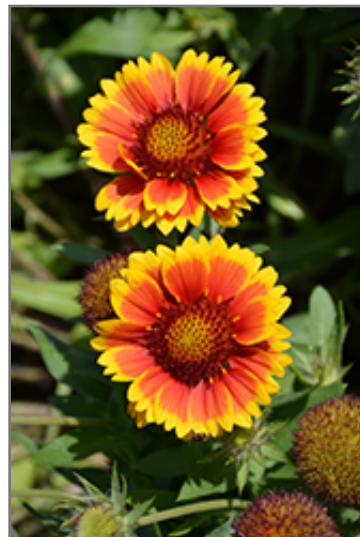
Arizona Sun Blanket Flower flowers

Arizona Sun Blanket Flower is recommended for the following landscape applications;