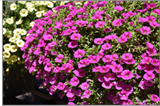
Cabaret Pink Calibrachoa flowers

Cabaret Pink Calibrachoa is recommended for the following landscape applications;