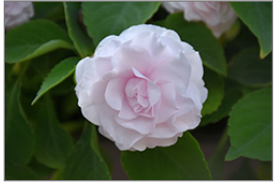
Glimmer White Double Impatiens flowers