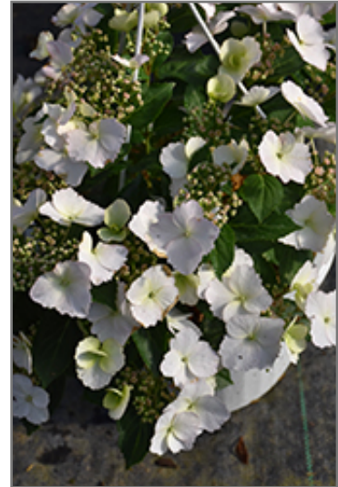
Fairytrail Bride Cascade Hydrangea flowers