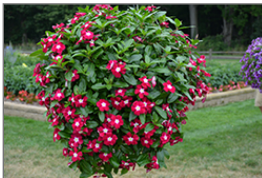
Mediterranean XP Burgundy Halo Vinca in bloom