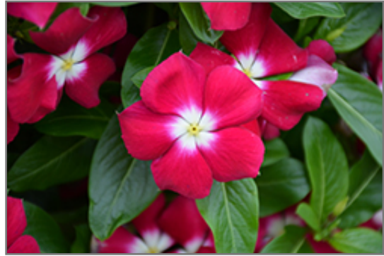
Mediterranean XP Burgundy Halo Vinca flowers

Mediterranean XP Burgundy Halo Vinca is a dense herbaceous annual with a trailing habit of growth, eventually spilling over the edges of hanging baskets and containers. Its medium texture blends into the garden, but can always be balanced by a couple of finer or coarser plants for an effective composition.