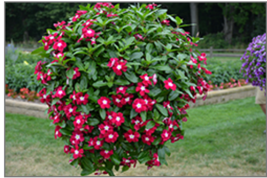
Mediterranean XP Burgundy Halo Vinca in bloom