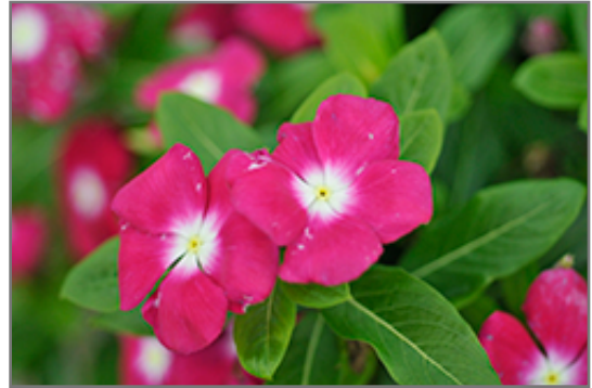
Pacifica XP Magenta Halo Vinca flowers

This plant will require occasional maintenance and upkeep, and should not require much pruning, except when necessary, such as to remove dieback. It is a good choice for attracting butterflies to your yard, but is not particularly attractive to deer who tend to leave it alone in favor of tastier treats. It has no significant negative characteristics.