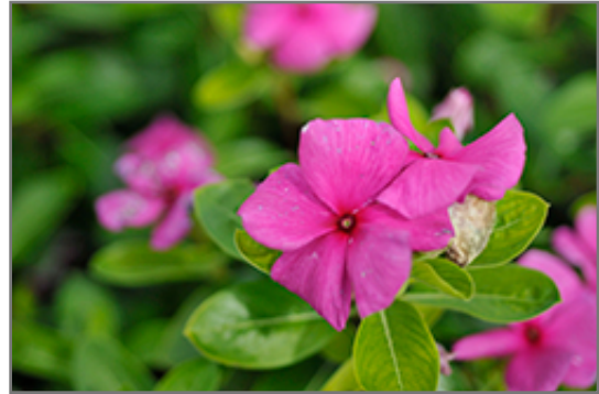
Pacifica XP Lilac Vinca flowers

This plant will require occasional maintenance and upkeep, and should not require much pruning, except when necessary, such as to remove dieback. It is a good choice for attracting butterflies to your yard, but is not particularly attractive to deer who tend to leave it alone in favor of tastier treats. It has no significant negative characteristics.