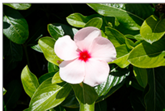
Pacifica XP Apricot Vinca flowers

Pacifica XP Apricot Vinca is recommended for the following landscape applications;