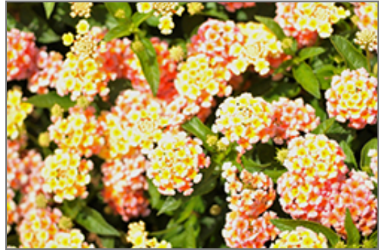
Lucky Peach Lantana flowers

Lucky Peach Lantana is recommended for the following landscape applications;