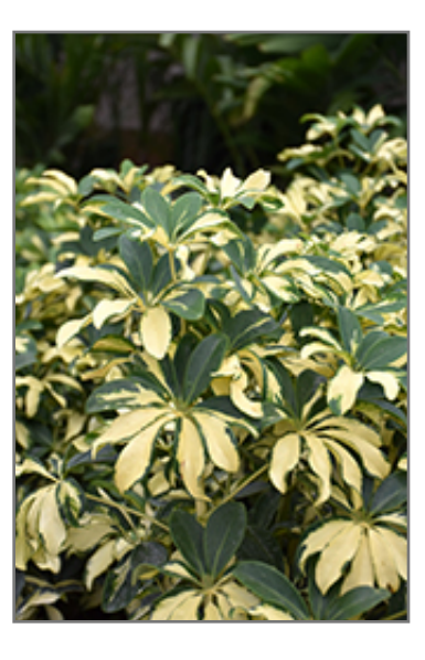
Gold Capella Schefflera foliage

When grown indoors, Gold Capella Schefflera can be expected to grow to be about 5 feet tall at maturity, with a spread of 3 feet. It grows at a medium rate, and under ideal conditions can be expected to live for approximately 10 years. This houseplant performs well in both bright or indirect sunlight and strong artificial light, and can therefore be situated in almost any well-lit room or location. It prefers to grow in average to moist soil. The surface of the soil shouldn't be allowed to dry out completely, and so you should expect to water this plant once and possibly even twice each week. Be aware that your particular watering schedule may vary depending on its location in the room, the pot size, plant size and other conditions; if in doubt, ask one of our experts in the store for advice. It is not particular as to soil type or pH; an average potting soil should work just fine. Be warned that parts of this plant are known to be toxic to humans and animals, so special care should be exercised if growing it around children and pets.