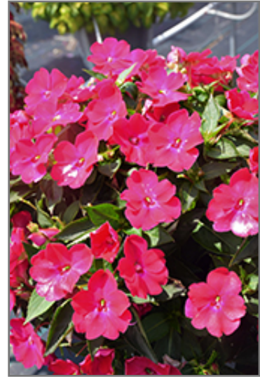
SunPatiens Compact Rose Glow New Guinea Impatiens flowers

SunPatiens Compact Rose Glow New Guinea Impatiens is a fine choice for the garden, but it is also a good selection for planting in outdoor containers and hanging baskets. It can be used either as 'filler' or as a 'thriller' in the 'spiller-thriller-filler' container combination, depending on the height and form of the other plants used in the container planting. It is even sizeable enough that it can be grown alone in a suitable container. Note that when growing plants in outdoor containers and baskets, they may require more frequent waterings than they would in the yard or garden.