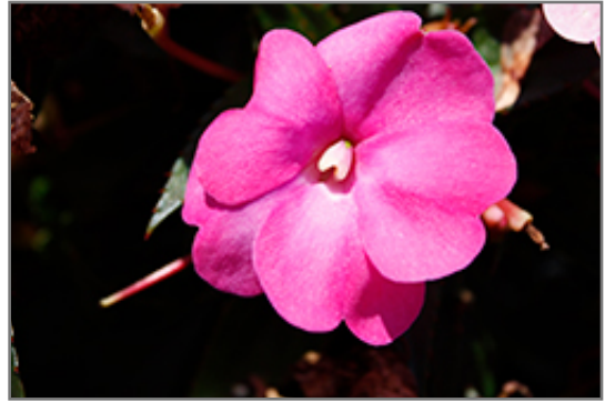
SunPatiens Compact Hot Pink New Guinea Impatiens flowers