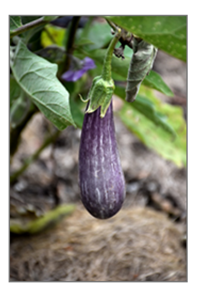
Fairy Tale Eggplant fruit

Fairy Tale Eggplant will grow to be about 24 inches tall at maturity, with a spread of 24 inches. When planted in rows, individual plants should be spaced approximately 30 inches apart. This fast-growing vegetable plant is an annual, which means that it will grow for one season in your garden and then die after producing a crop.