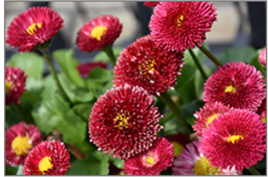
Tasso Red English Daisy flowers

Tasso Red English Daisy is recommended for the following landscape applications;