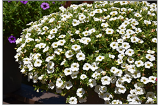
Cabaret Bright White Calibrachoa flowers

This is a relatively low maintenance plant, and should not require much pruning, except when necessary, such as to remove dieback. It is a good choice for attracting bees, butterflies and hummingbirds to your yard, but is not particularly attractive to deer who tend to leave it alone in favor of tastier treats. It has no significant negative characteristics.