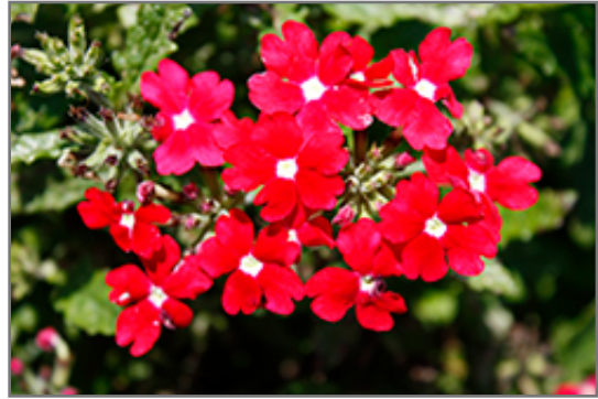
Cadet Upright Red Verbena flowers

Cadet Upright Red Verbena is recommended for the following landscape applications;