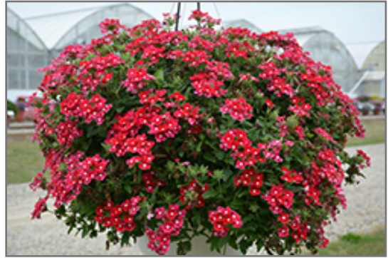
Cadet Upright Red Verbena in bloom

Cadet Upright Red Verbena will grow to be about 10 inches tall at maturity, with a spread of 14 inches. When grown in masses or used as a bedding plant, individual plants should be spaced approximately 10 inches apart. Its foliage tends to remain low and dense right to the ground. This fast-growing annual will normally live for one full growing season, needing replacement the following year.