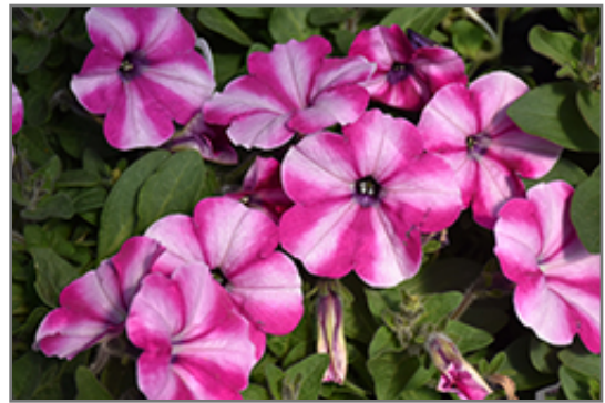
Headliner Raspberry Star flowers