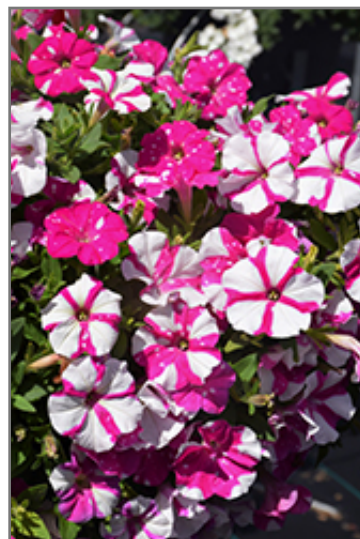
Headliner Pink Sky Petunia flowers

Headliner Pink Sky Petunia is recommended for the following landscape applications;