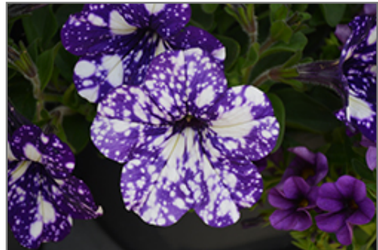
Headliner Night Sky Petunia flowers

Headliner Night Sky Petunia is recommended for the following landscape applications;