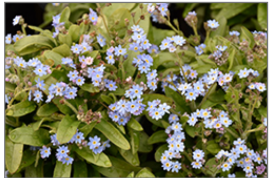
Victoria Blue Forget-Me-Not flowers