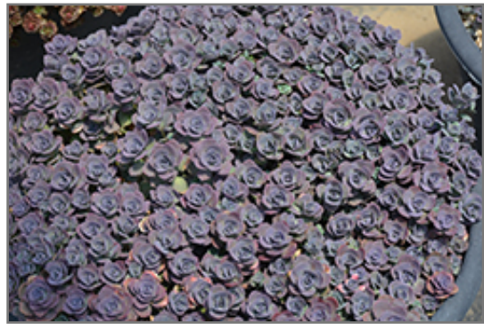
SunSparkler Blue Elf Sedoro