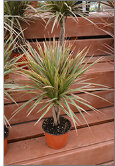
Colorama Dracaena in full

When grown indoors, Colorama Dracaena can be expected to grow to be about 3 feet tall at maturity, with a spread of 24 inches. It grows at a medium rate, and under ideal conditions can be expected to live for approximately 10 years. This houseplant performs well in both bright or indirect sunlight and strong artificial light, and can therefore be situated in almost any well-lit room or location. It does best in average to evenly moist soil, but will not tolerate standing water. The surface of the soil shouldn't be allowed to dry out completely, and so you should expect to water this plant once and possibly even twice each week. Be aware that your particular watering schedule may vary depending on its location in the room, the pot size, plant size and other conditions; if in doubt, ask one of our experts in the store for advice. It is not particular as to soil type or pH; an average potting soil should work just fine.