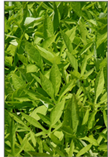
SolarPower Lime Sweet Potato Vine foliage